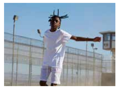
Sunday 11th (10am) Director Contessa Gayles

Documentary Feature 106 mins | USA | 2024