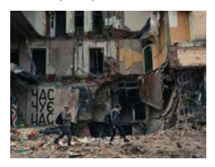
Sunday 11th (12:15pm) Directors Brendan Bellomo & Slava Leontyev Documentary Feature 97 mins | Ukraine | 2024

Documentary Feature 106 mins | USA | 2024